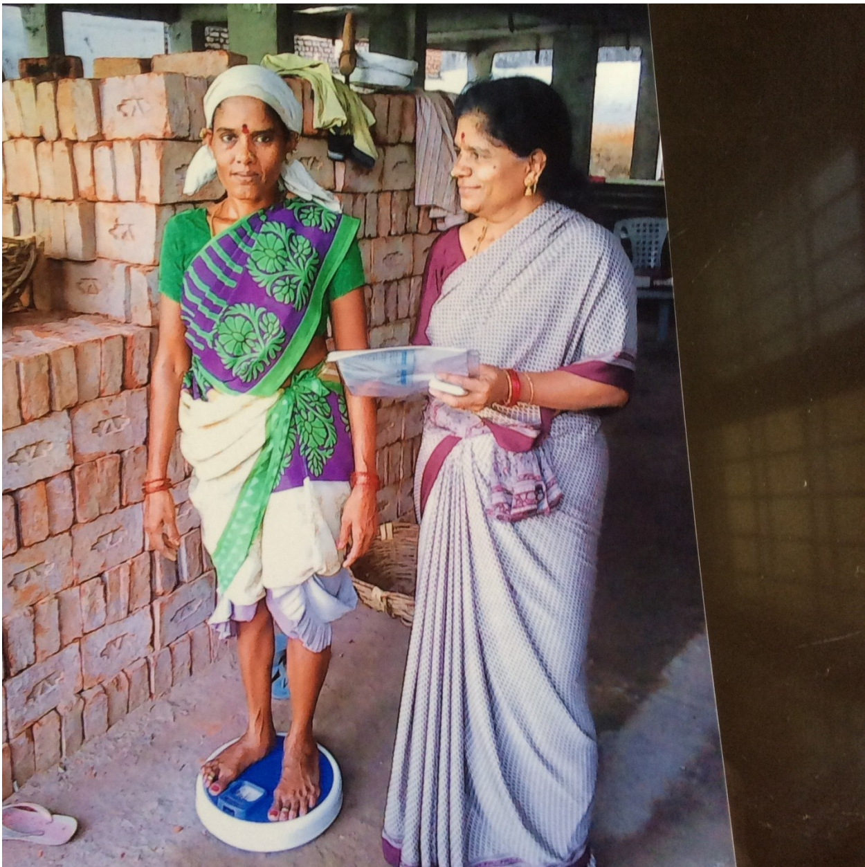
Figure 1 Taking Weight of the respondents at work site