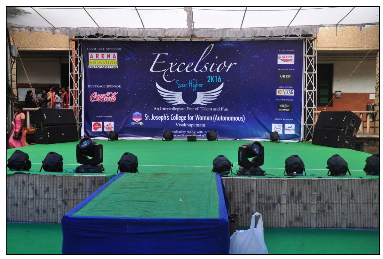
THE STAGE SET FOR THE GRAND EVENT - EXCELSIOR 2K16 - THE INTERCOLLEGIATE FEST