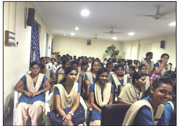
A special awareness campaign in the Seminar hall to take ragging seriously.