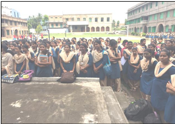
The Assembly of students gathered while they listen to the instructions being given