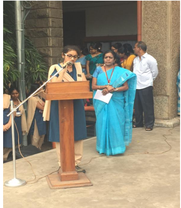
The President of the Student Council creating awareness about ragging as a crime – the Coordinator of the Anti Ragging Cell looks on..