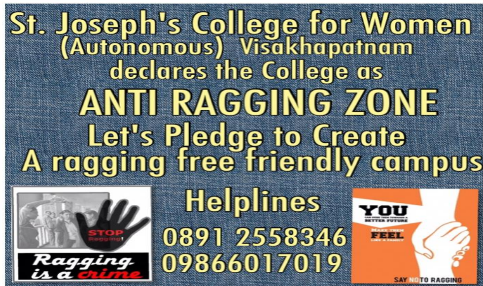
Banners displayed in three places (close view)

3. Display of banners and notices in the campus – A sufficient number of banners are displayed in prominent places in the campus along with notices in Notice Boards.